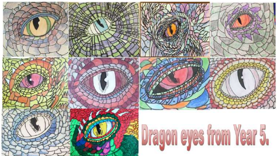
Dragon eyes from Year 5.

We think you'll agree that we have some very talented artists in Year 5- well done all!