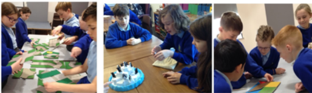
Year 5 Puzzle Maths.

Fantastic fun this week, finding patterns and problem solving by working collaboratively.